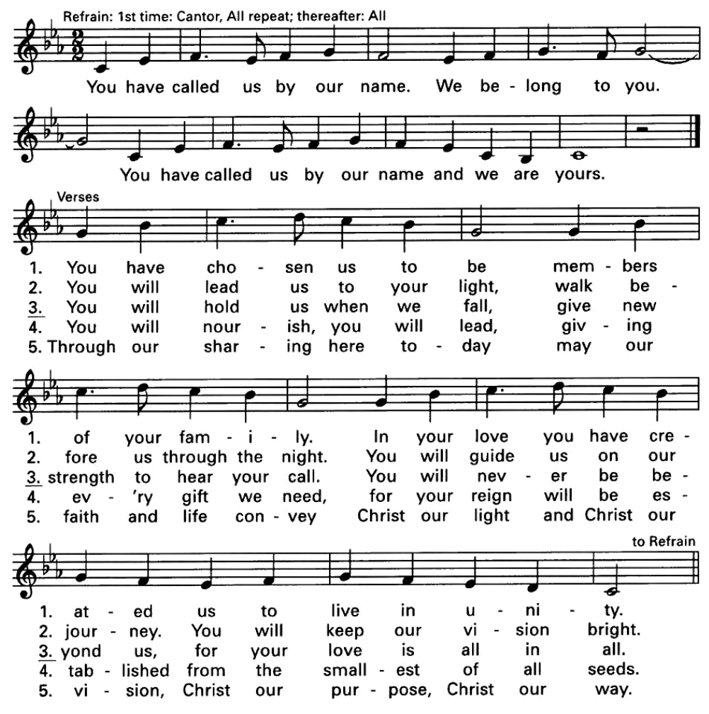
© 1995, Bernadette Farrell, Published by OCP Publications. All rights reserved. LicenSing Online #776583